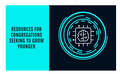
Lakeside Institute July 21-27, 2024

If you missed this event or lost your notes, you can now find the resources shared during the day and hear what others thought by visiting www.generateohio.org. Not only will you find the notebooks and slides shared during Generate, additional resources like summer camp options, connecting with our family ministry networks, and micro-grant information is available. Stop by often as resources are being added frequently.